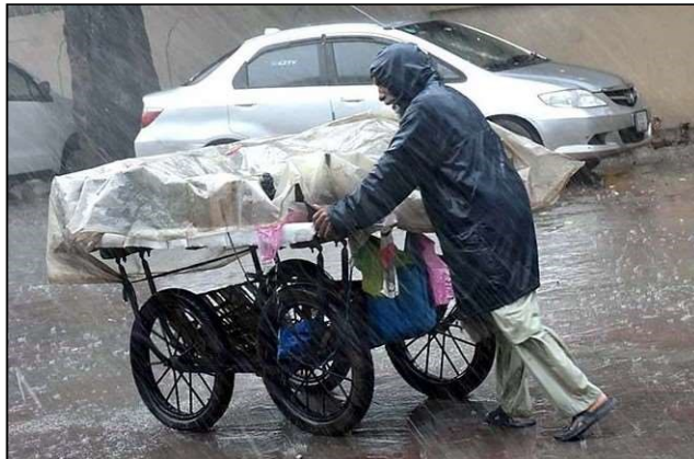
SLALKOT: An old person pushing his handcart loaded with vegetable during the heavy rain, here Thursday.